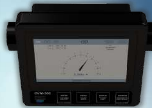
CONTROL DISPLAY UNIT