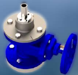
VALVE SENSOR UNIT