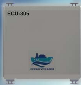
ELECTRONIC CONTROL UNIT